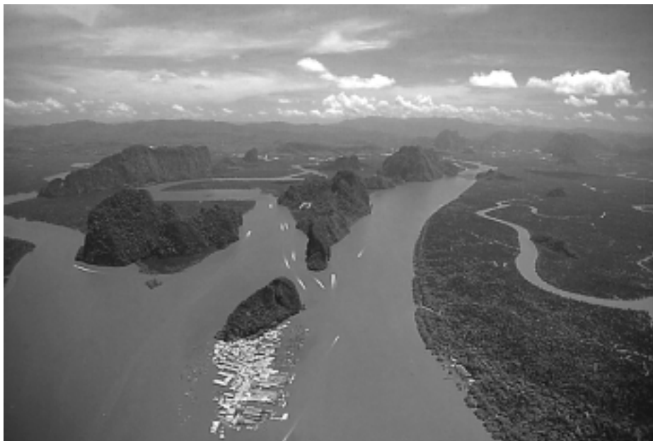
Village of Koh Pannyyi, in Phangnga Bay near Phuket, Thailand. Koh Pannyyi is a fishing village floating on bamboo shoots.